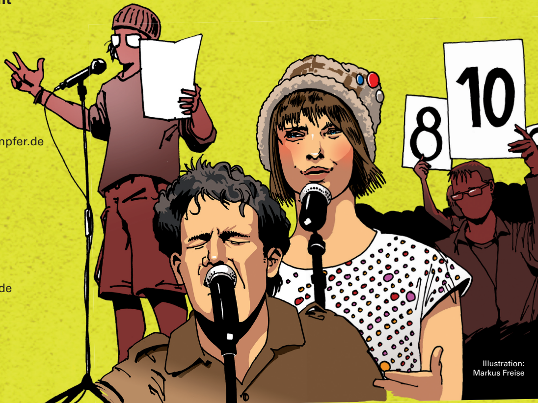
Illustration: Markus Freise